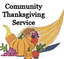
Community Thanksgiving Service