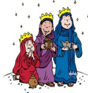
Children's Christmas Program

Scotland County Ministerial Alliance Thanksgiving Service @ 7pm, SCR-1 Elementary gym