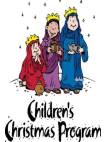
Children's Christmas Program

There is a sign up sheet in the East foyer for helping out or bringing in food.